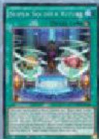
Ritual Spell Card

3 After sending the Tributed monsters to the Graveyard, play the Ritual Monster Card in your Main Monster Zone in either face-up Attack or Defense Position. Finally, place the Ritual Spell Card in the Graveyard.